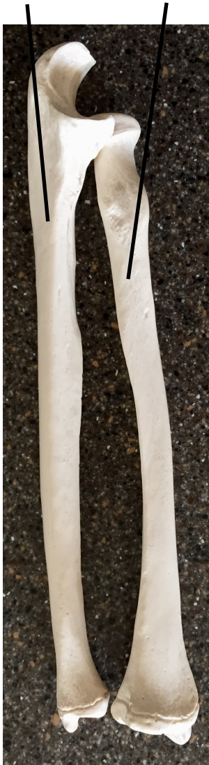
Anterior View, Left Ulna and Radius