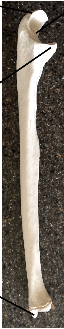
Anterior View, Left Ulna