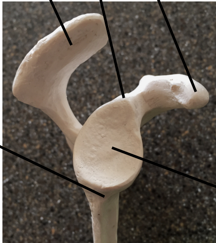
Lateral View, Right Scapula