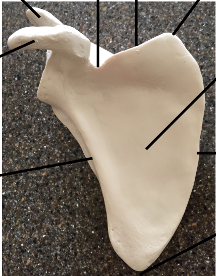
Anterior View, Right Scapula