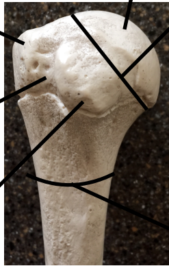
Anterior View, Right Humerus Proximal End