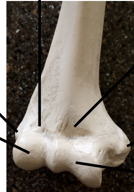
Anterior View, Right Humerus Distal End