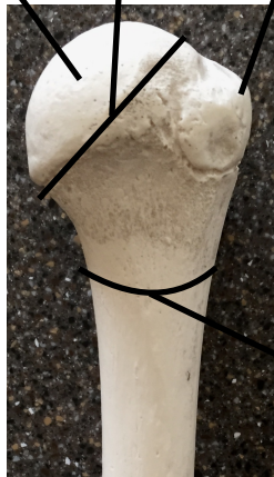
Posterior View, Right Humerus Proximal End