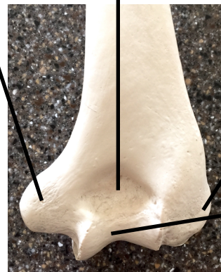
Posterior View, Right Humerus Distal End