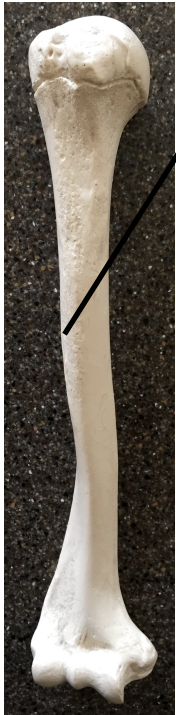
Anterior View, Right Humerus